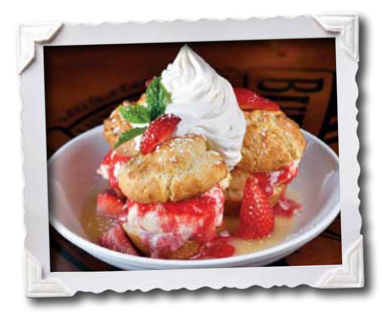
Mama's Best Strawberry Shortcake With Mama's homemade Biscuits! 7.99 Single Serving of Strawberry Shortcake 5.99

Mama's warm Bread Pudding, Homemade Biscuit topped with fresh Strawberries and melt in your mouth Chocolate Chip Cookie Sundae. 12.99