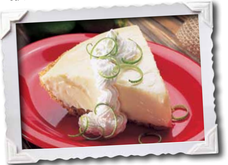
Key Lime Pie 6.49

Chocolate Chip Cookie Sundae Fresh baked Chocolate Chip Cookie served warm with Vanilla Ice Cream, topped with Chocolate and Caramel Sauce, Peanuts and Whipped Cream 7.99